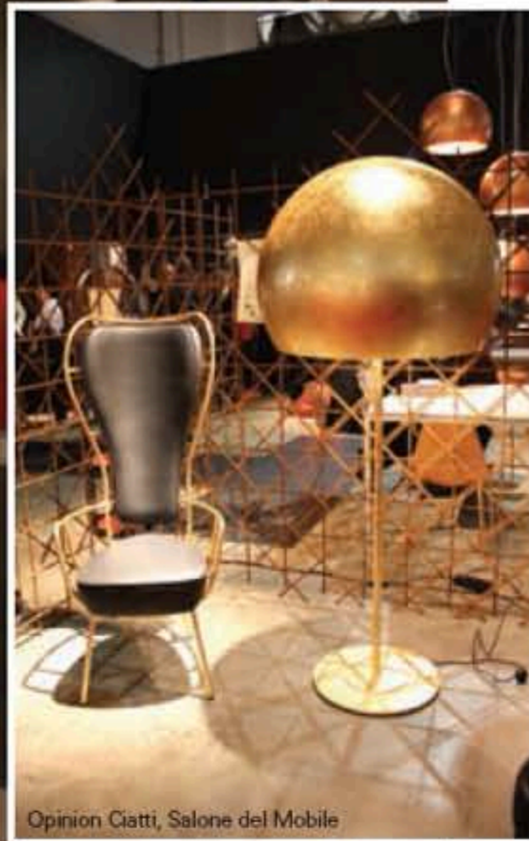
Opinion Ciatti, Salone del Mobile

Lighting has gone big and can be found in a variety of colours and finishes. Statement, large-scale light fixtures, a cluster of multiples or a striking style, can shake up an entire room. Lights are focal points and can be as important as art, furniture or an interior paint palette. Lighting can also dictate the entire personality or mood of a space. Don't hesitate mixing and matching finishes among light fixtures, hardware and plumbing – the mixed metal palette creates an interesting and inviting scene. You will soon see the illuminating impact created by sconces, lamps, pendants and chandeliers and how they can anchor a space or simply draw immediate design-worthy attention.