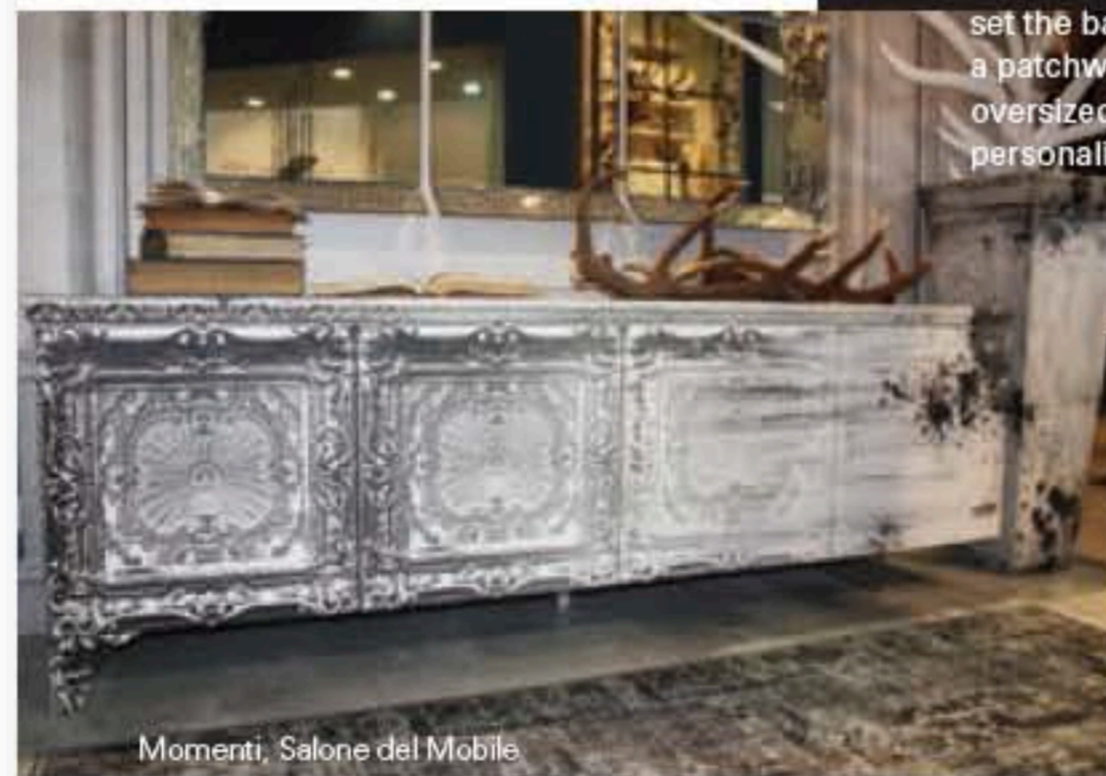
Momenti, Salone del Mobile