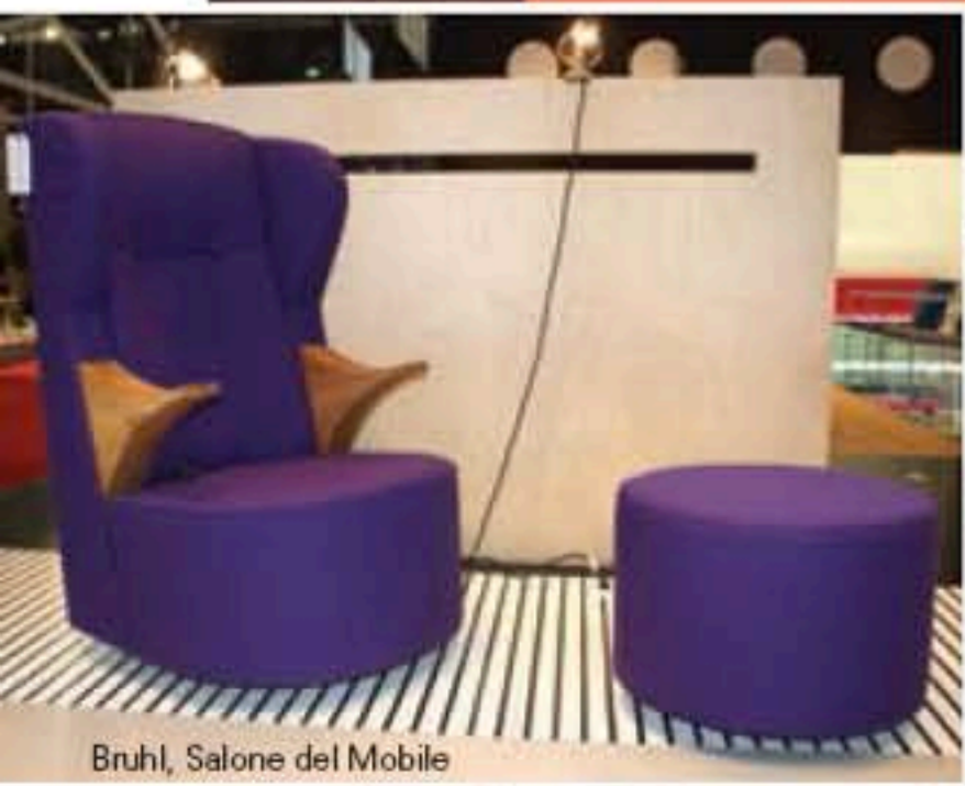
Bruhl, Salone del Mobile