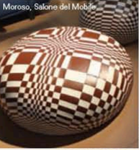
Moroso, Salone del Mobile