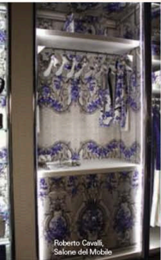
Roberto Cavalli, Salone del Mobile

2016 exudes confidence with strong, darker mid-tones mixed with milky pastels inspired by history and romance. Natural monochromatic tones pair with softened, reflective hues in retro influences, while rich leather and marine tones along with vibrant jewel and fruit colours come together for a decadent atmosphere. Paint colours for the home will still revolve around sophisticated cleaner whites, smokier neutrals and updated muted pastels. Feature walls are out and zone painting schemes are in.