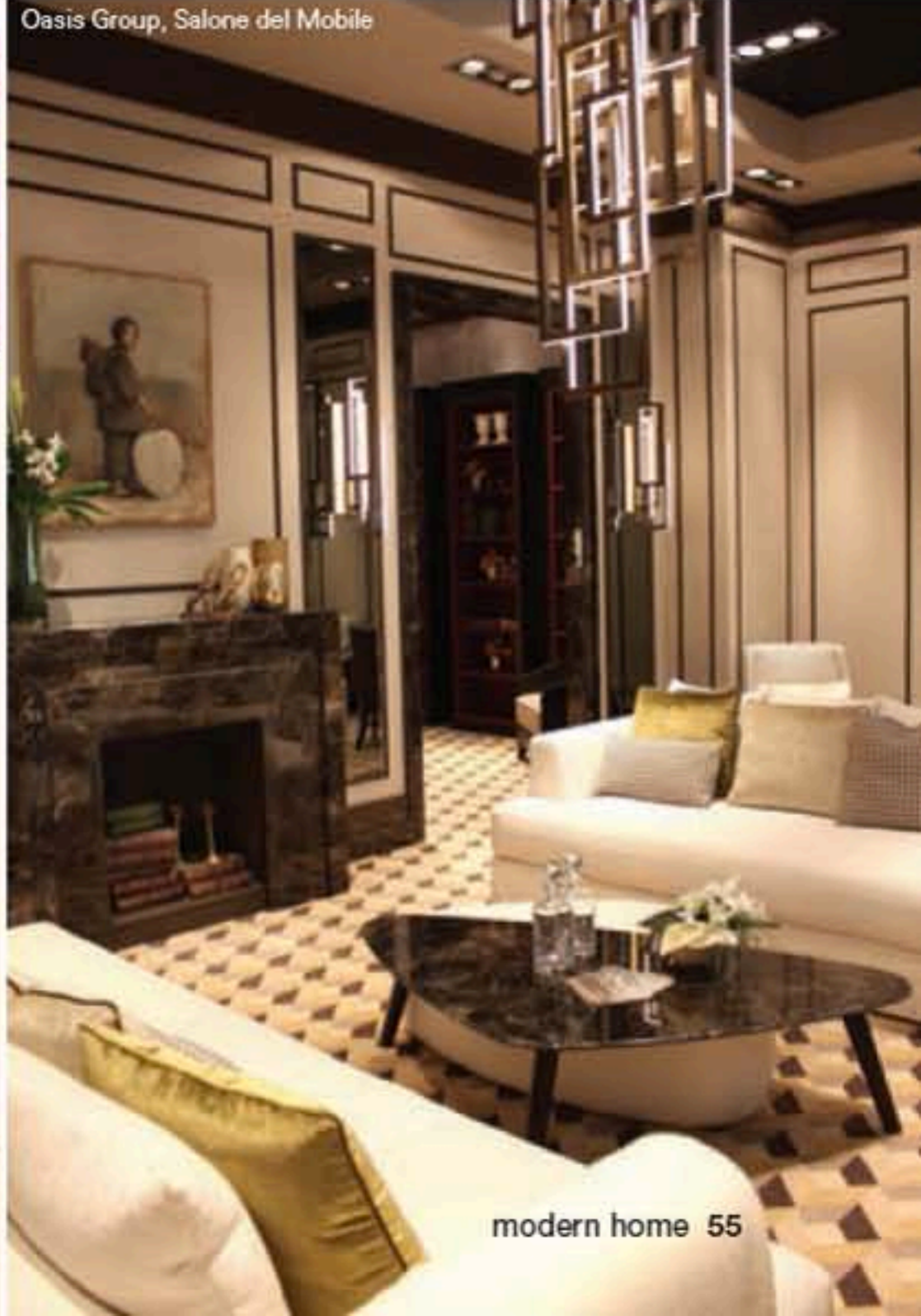
Oasis Group, Salone del Mobile