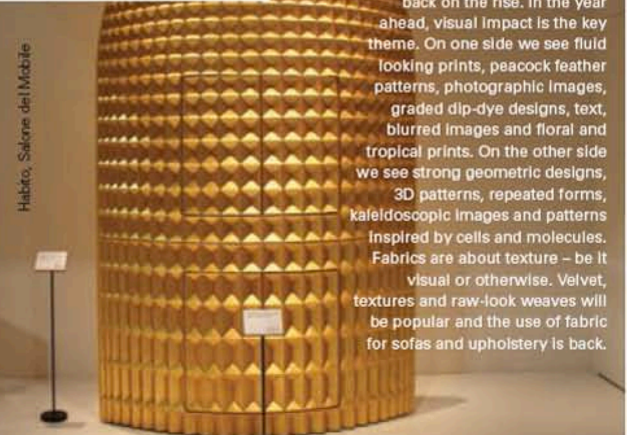
Habro, Salone del Mobile

Prints and pattern are definitely back on the rise. In the year ahead, visual impact is the key theme. On one side we see fluid looking prints, peacock feather patterns, photographic images, graded dip-dye designs, text, blurred images and floral and tropical prints. On the other side we see strong geometric designs, 3D patterns, repeated forms, kaleidoscopic images and patterns inspired by cells and molecules. Fabrics are about texture – be it visual or otherwise. Velvet, textures and raw-look weaves will be popular and the use of fabric for sofas and upholstery is back.