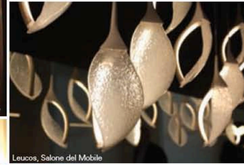
Leucos, Salone del Mobile