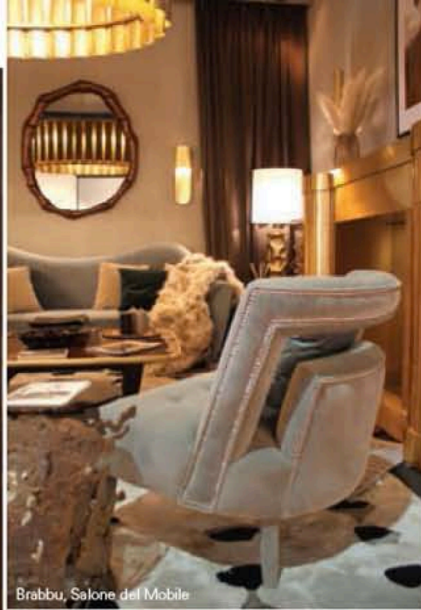
Brabbu, Salone del Mobile