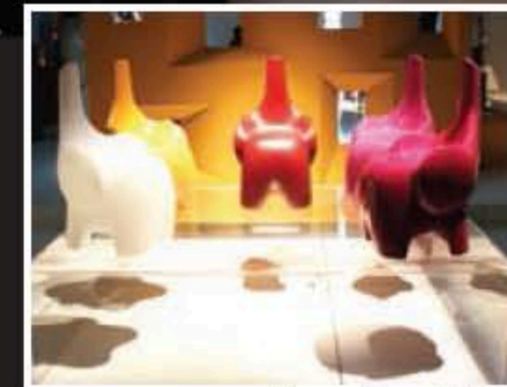
Myyour, Salone del Mobile