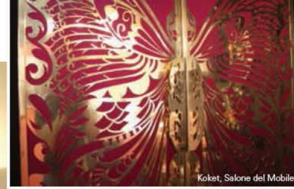
Koket, Salone del Mobile