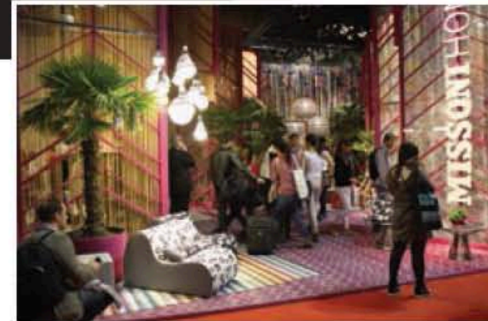
Missoni Home, Salone del Mobile