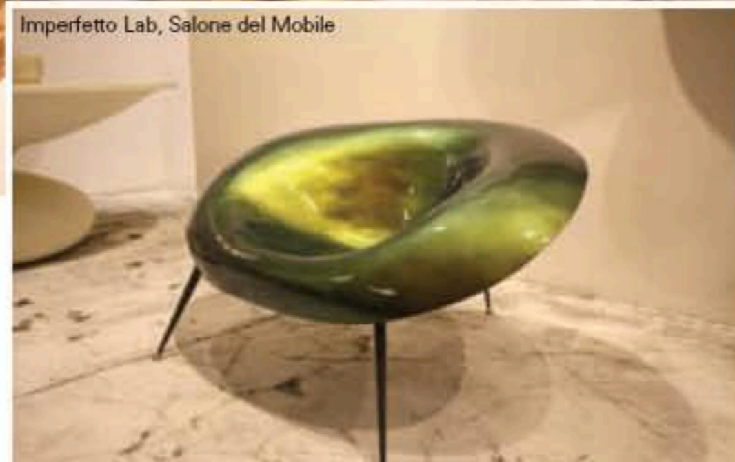
Imperfetto Lab, Salone del Mobile

Textures derived from nature such as animal, mineral or vegetables will be in. Think botany, insect prints, fossils, bone, wood, bark, and stone. Materials and finishes that are authentic are being used in more simple ways in order to appreciate natural beauty. To soften the lines of crisp and clean-look modern homes, organic inspired shades will be added. Graceful, rounded forms will be very popular and will be in the direction of hanging, dripping droplet forms that look like they almost just grew in the space naturally. This trend is coming through mostly in accent pieces such as lighting, ceramics, glassware and accessories.