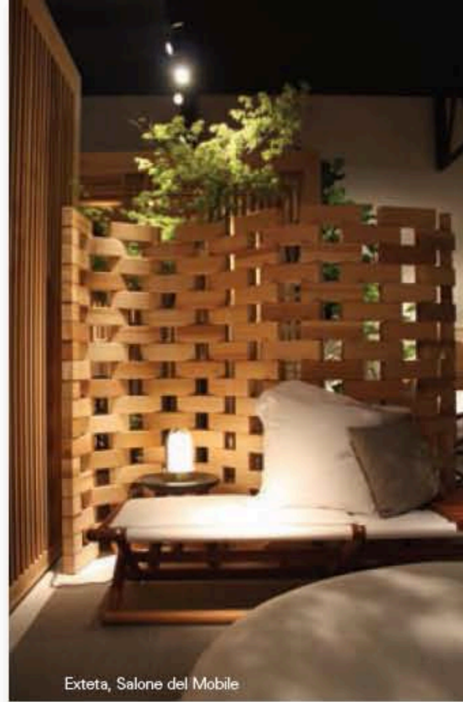
Exteta, Salone del Mobile