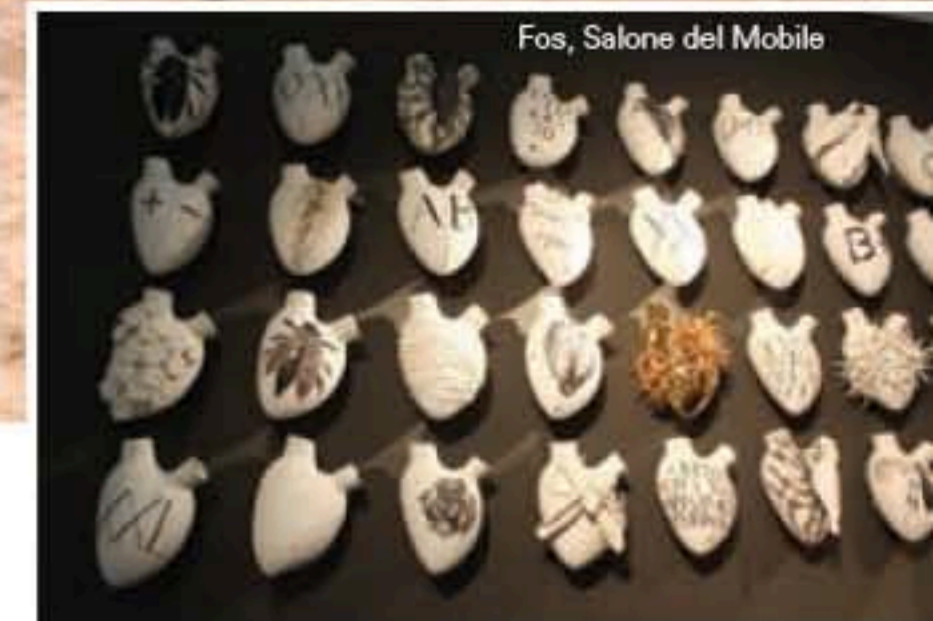
Fos, Salone del Mobile