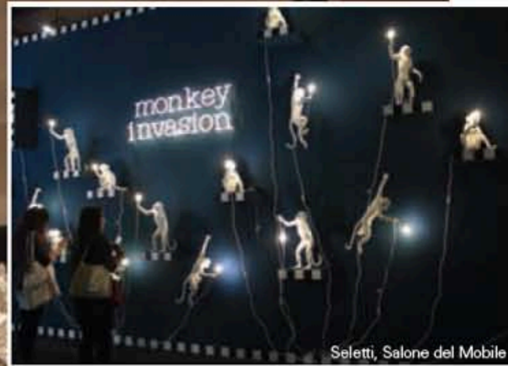
Seletti, Salone del Mobile