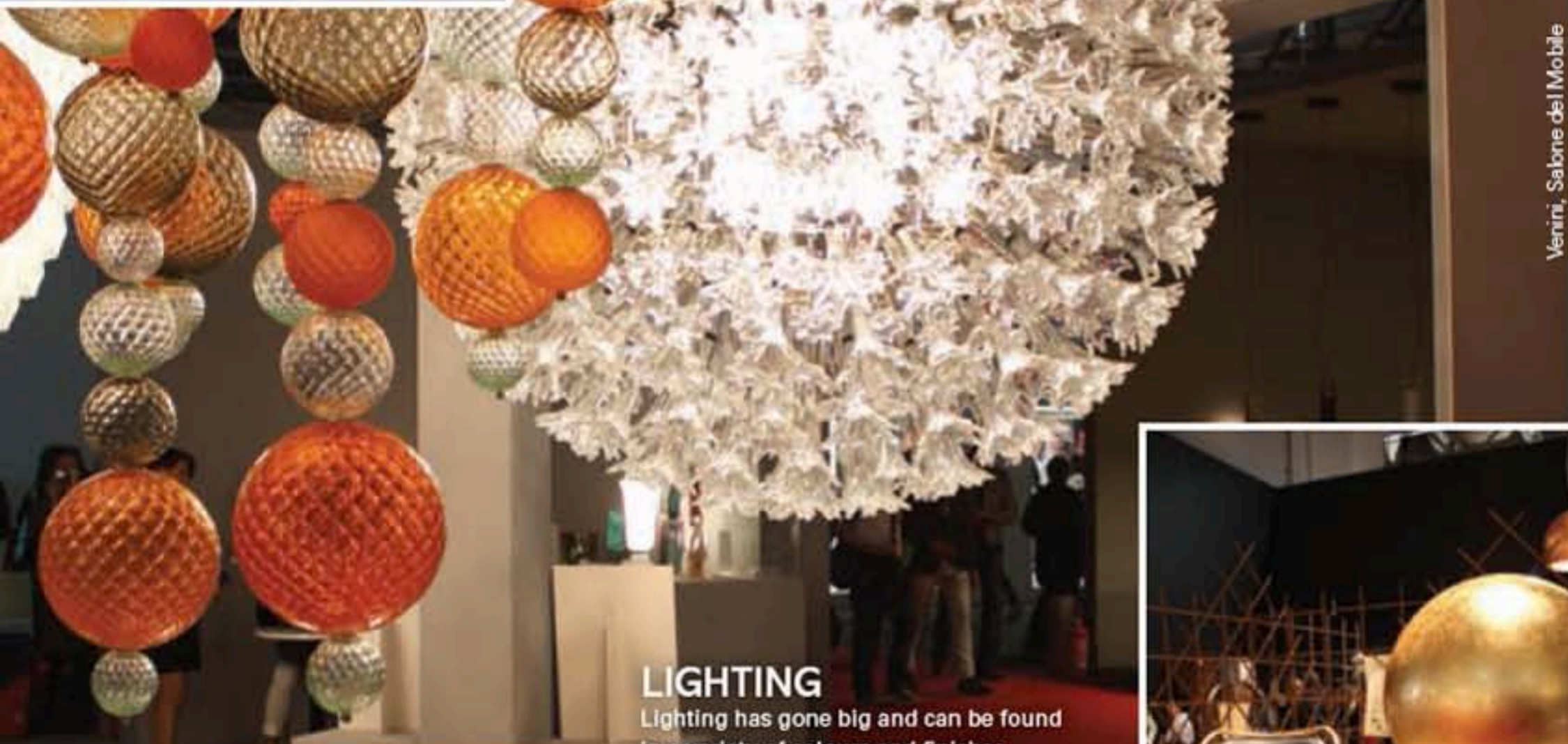
Verrini, Salone del Mobile