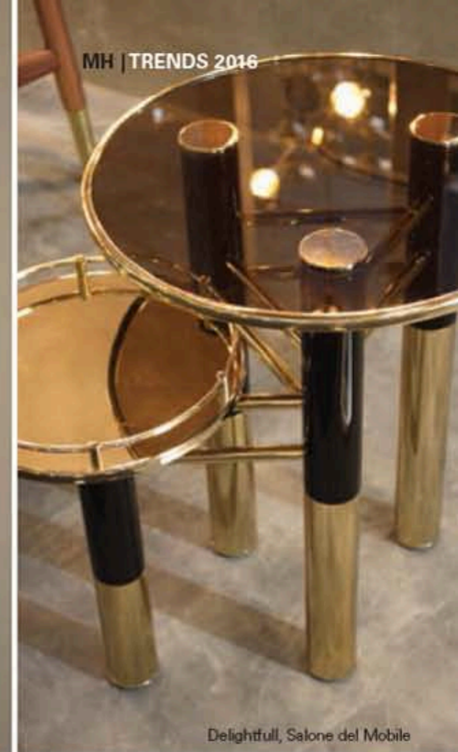
Delightfull, Salone del Mobile

The 1950s and 1970s are hot trends in fashion design collections at the moment, and it's no different in interiors – mid-century modern with brass, gold and metallic finishes will be even more popular in 2016. Gold is back in, in hardware, tapware and faucets. Copper will also continue to be a favourite but as it doesn't go with everything it will sit on the sidelines. Get ready to embrace some retro bling – mix it with white and new patterns so it doesn't feel as dated.