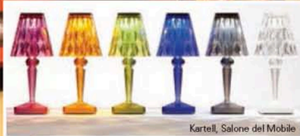
Kartell, Salone del Mobile