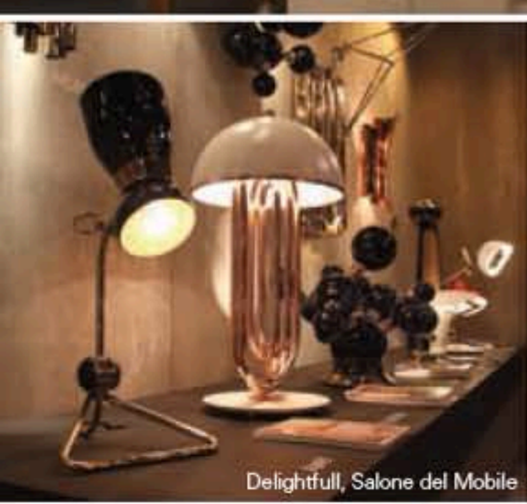
Delightfull, Salone del Mobile