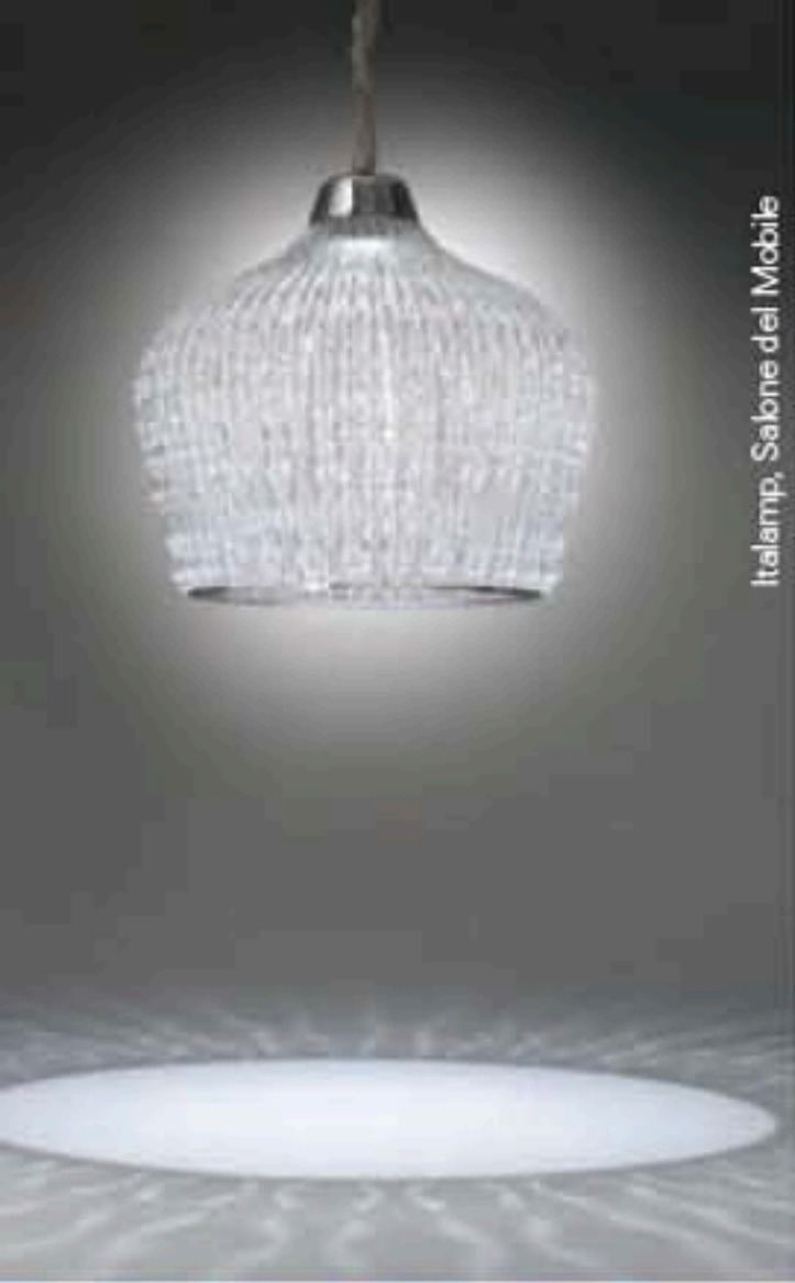
Italamp, Salone del Mobile