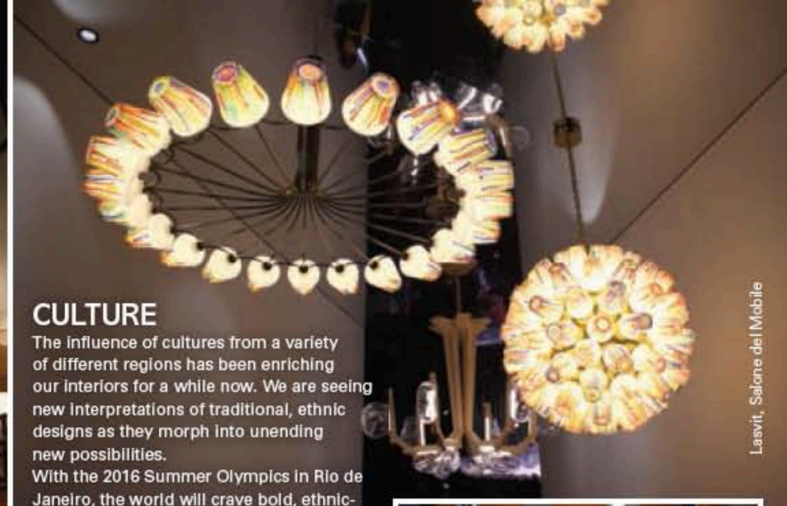
Lasvit, Salone del Mobile

Textured wood walls, floors and furnishings set the backdrop while bold wall coverings, a patchwork of colourful fabrics, rugs and oversized lighting layers on more personality and authentic interiors.