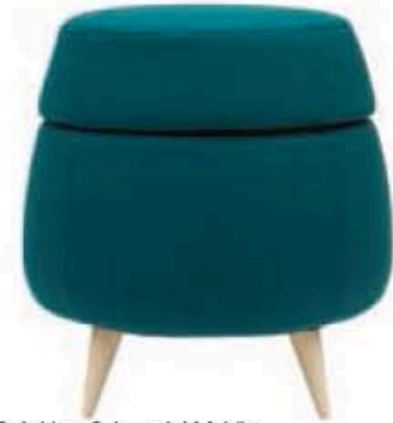
Soft Line, Salone del Mobile