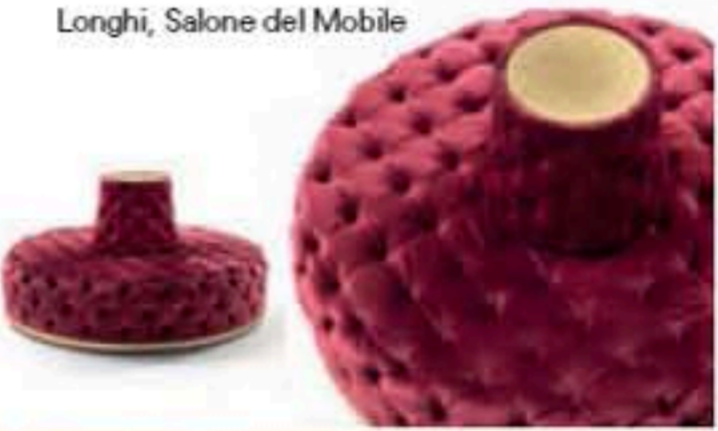
Longhi, Salone del Mobile