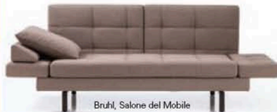
Bruhl, Salone del Mobile