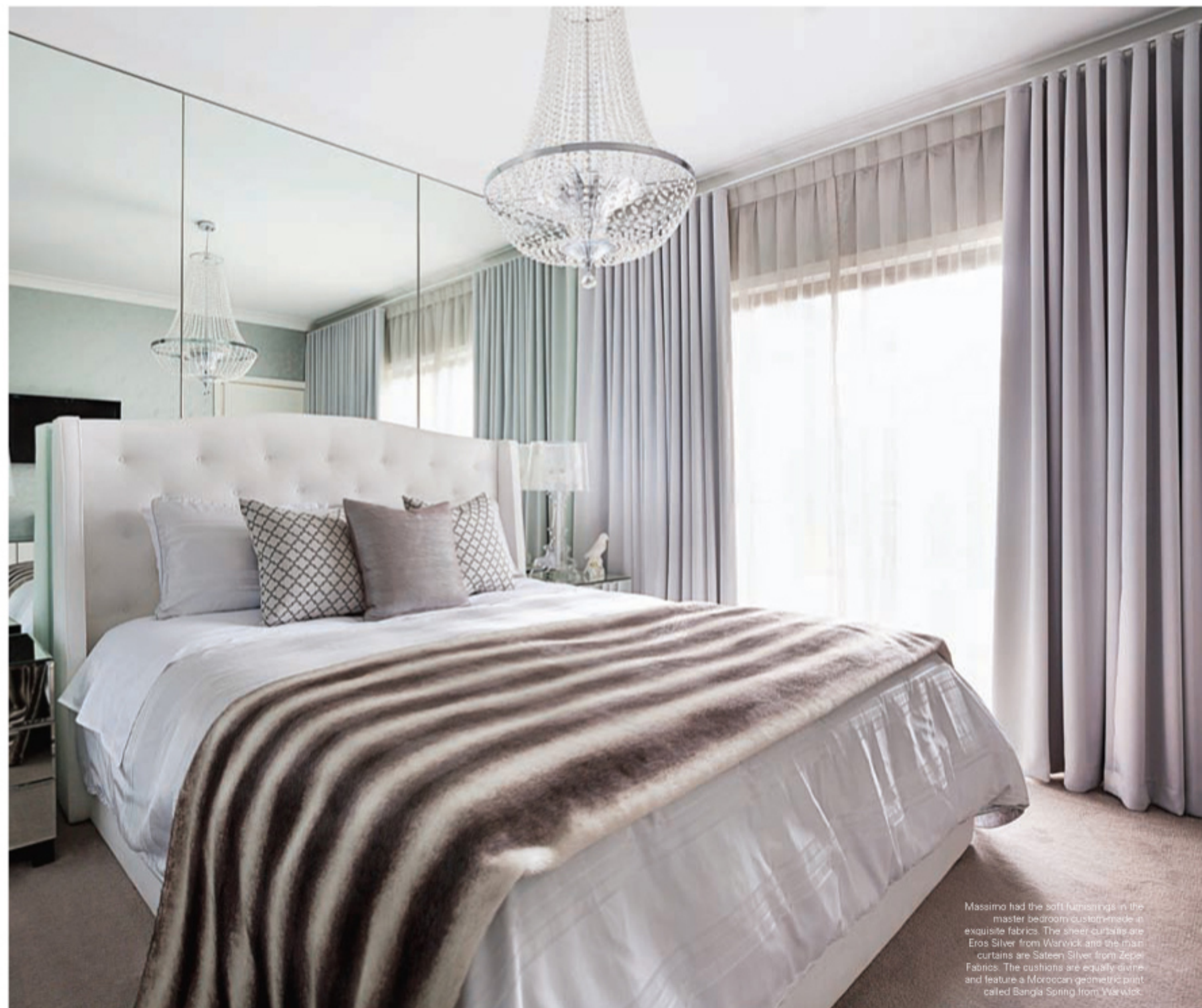
Massimo had the soft furnishings in the master bedroom custom-made in exquisite fabrics. The sheer curtains are Eros Silver from Warwick and the main curtains are Sateen Silver from Zepel Fabrics. The cushions are equally divine and feature a Moroccan geometric print called Bangla Spring from Warwick.