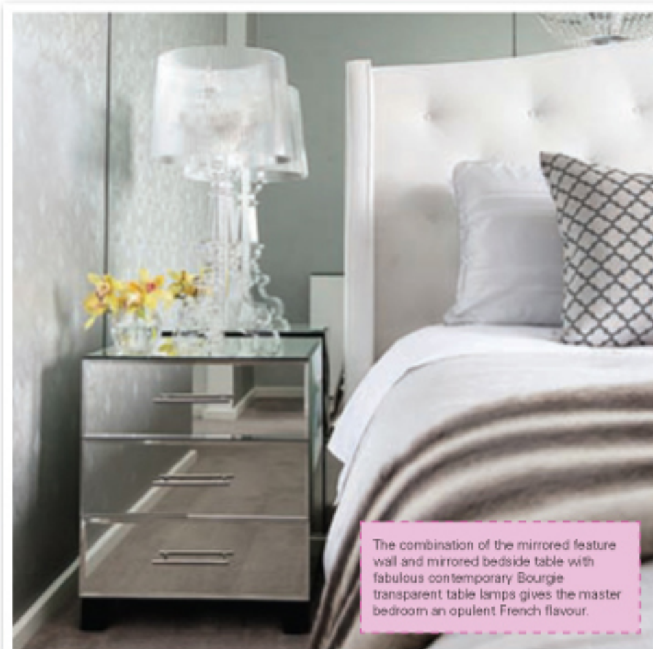
The combination of the mirrored feature wall and mirrored bedside table with fabulous contemporary Bourgie transparent table lamps gives the master bedroom an opulent French flavour.

“UPSTAIRS THE GLAMOUR CONTINUES IN THE MASTER BEDROOM, WHICH IS NOTHING SHORT OF MAGNIFICENT.”