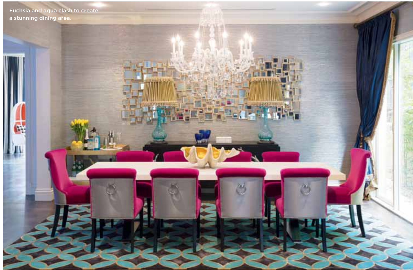
Fuchsia and aqua clash to create a stunning dining area.

WORDS // ANNABELLE CLOROS