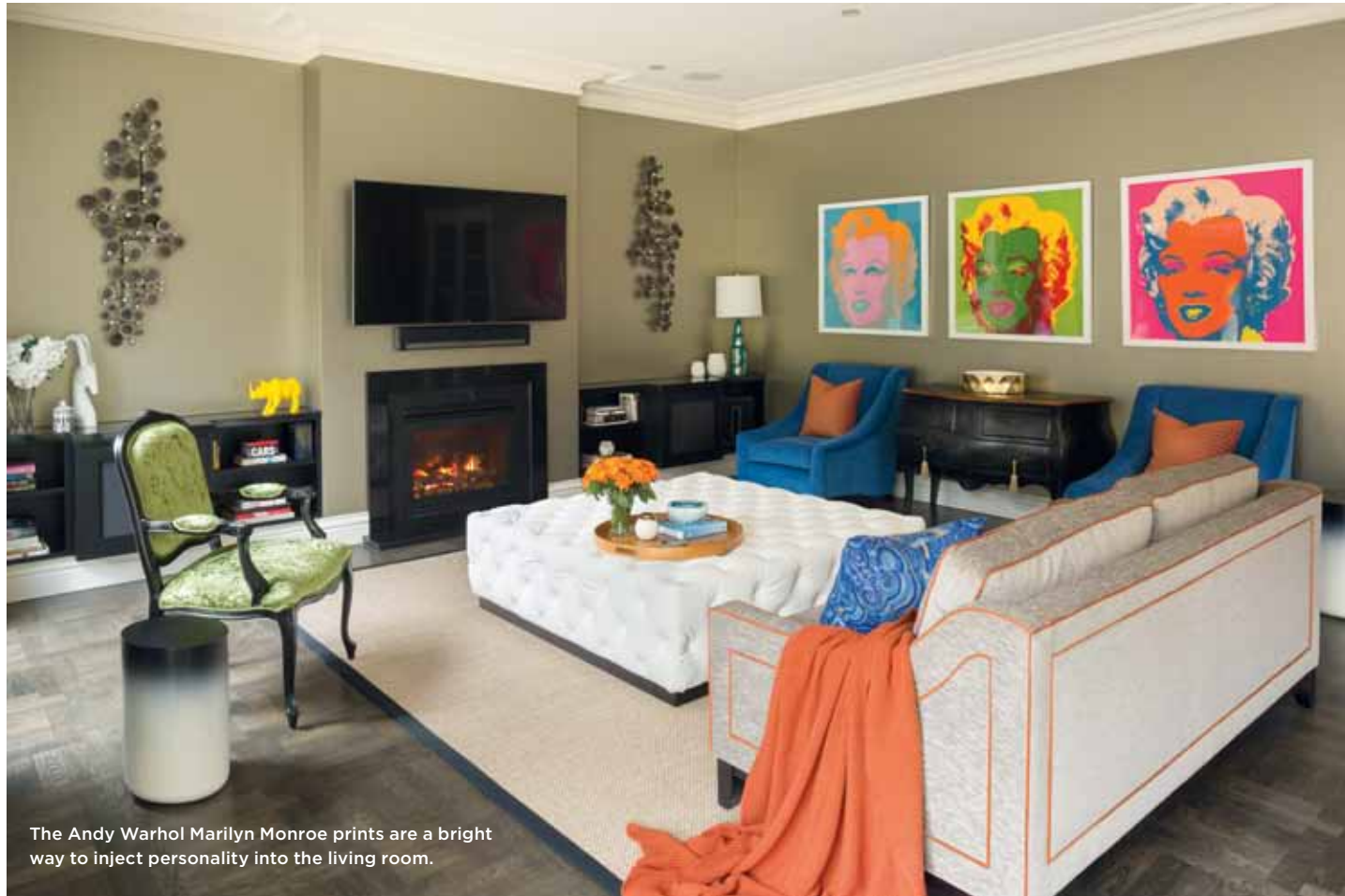
The Andy Warhol Marilyn Monroe prints are a bright way to inject personality into the living room.