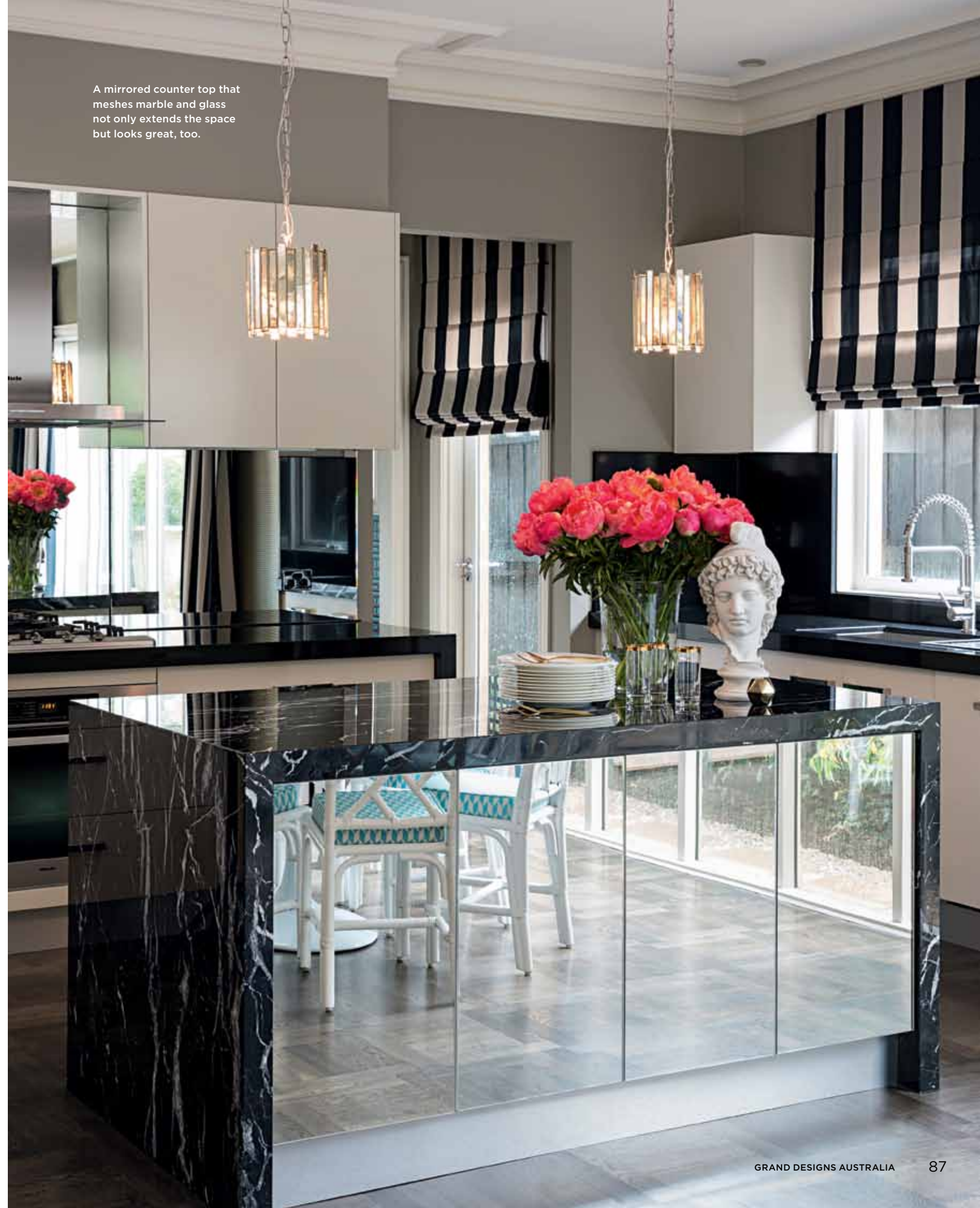
A mirrored counter top that meshes marble and glass not only extends the space but looks great, too.