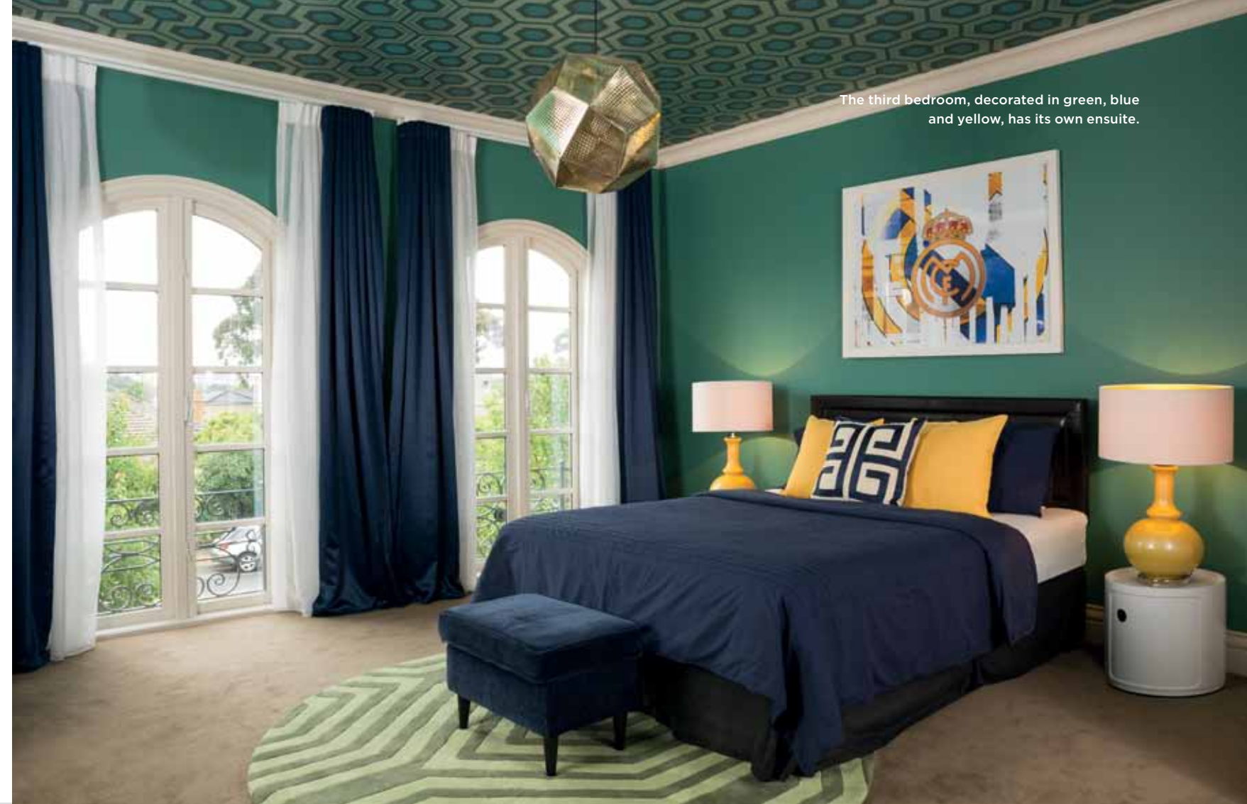
The third bedroom, decorated in green, blue and yellow, has its own ensuite.