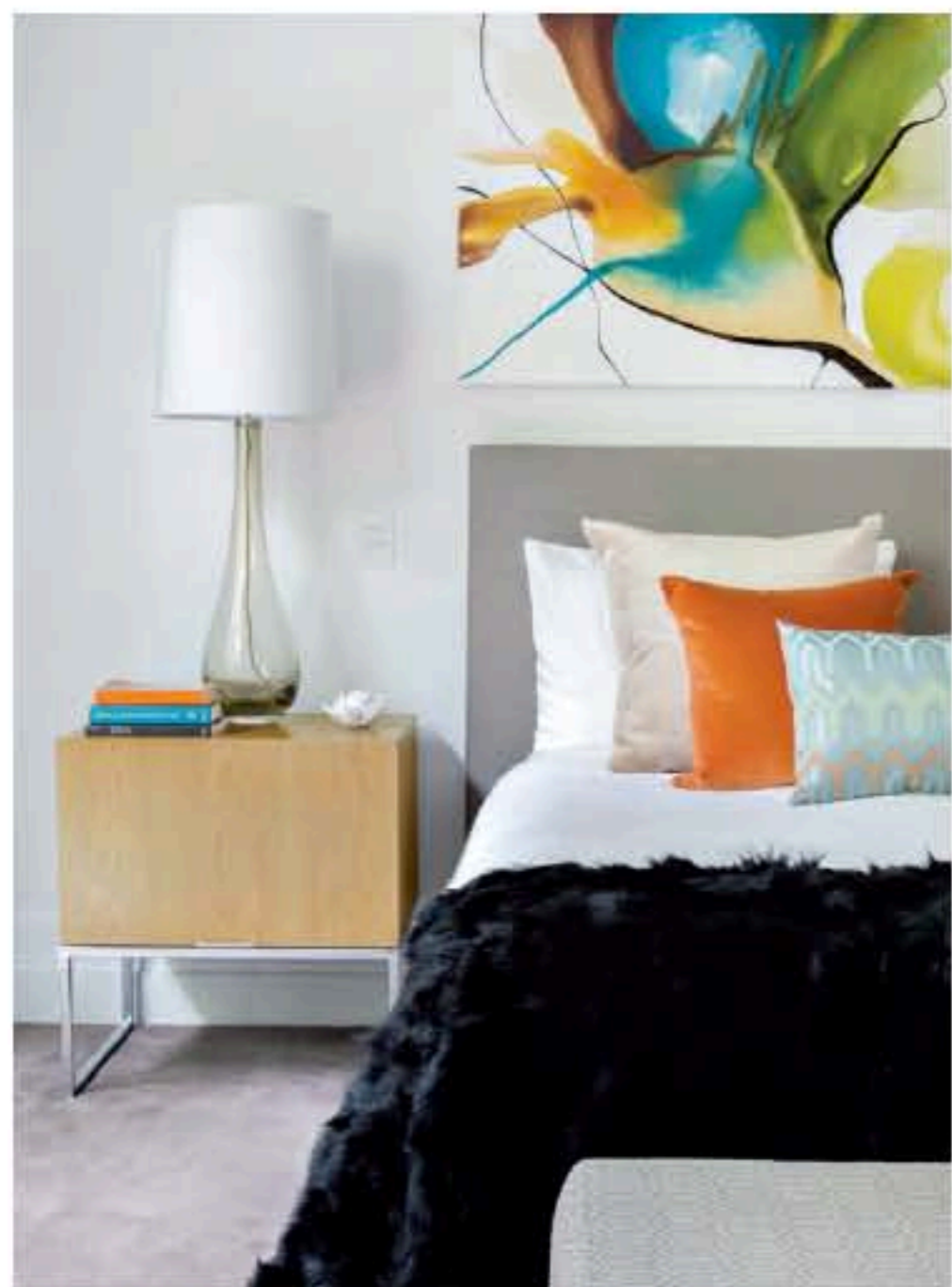
Above The custom-made bedside tables have an American oak veneer with polished chrome frames. The Gracie teardrop table lamps with an amber hand-blown glass base and white linen shade came from Diez Lighting in Mexico.

To complete the master bedroom, a welcoming leather occasional chair with a coordinated footstool, a luxe black throw at the foot of the bed and geometric ottomans which reference those found in the living room were chosen.